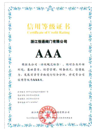
AAA Grade Credit Rating Certificate AAA级信用等级证书