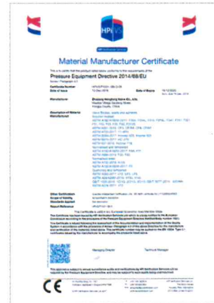
2014/68/EU (PED) 欧盟承压设备指令认证